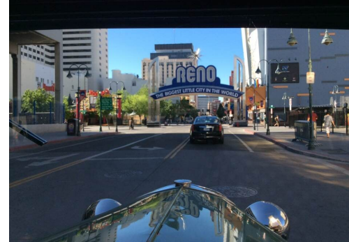
Candi leading the group into Reno