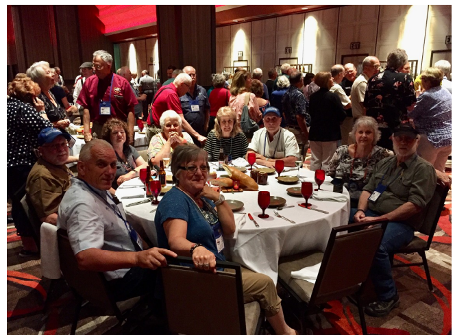
Our whole group at the welcome social