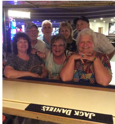
Most of our group