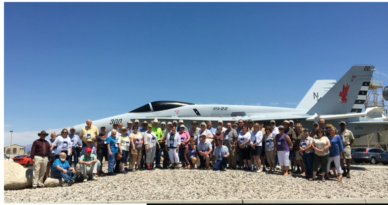
A group at Fallon naval/air

We all had a great time and arrived home again safely (maybe a little tired) but just in time for the 4th of July!